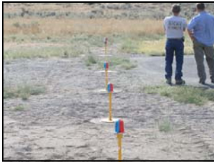
New Threshold Lights at Okanogan Legion Airport in Washington

“We helped Okanogan Airport, a non-NPIAS airport, relight their runway under WASHDOT funding and schedule restraints”