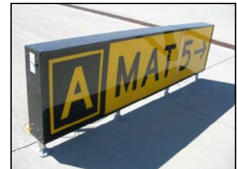
New Guidance Sign Installed on Existing Concrete Apron