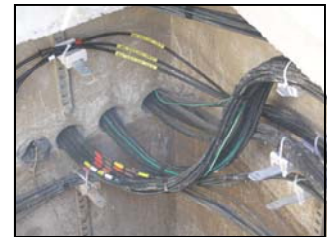
New Electrical Pullbox with Airfield Lighting Cables