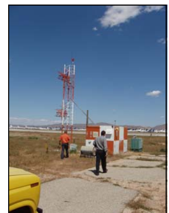
Performing Investigations for the Glide Slope at SCLA